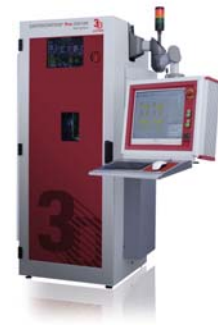
Sinterstation® Pro DM100 SLM System