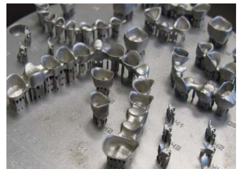
Dental caps, crowns and bridges from a digital scan.