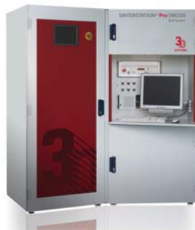
Sinterstation® Pro DM250 SLM System