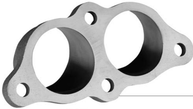
Lightweight automotive exhaust component