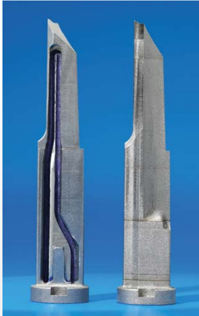
Injection mold insert with conformal cooling.