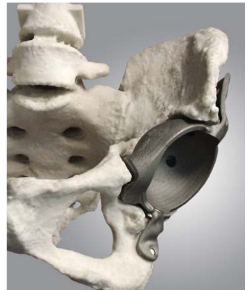
Custom hip implant.