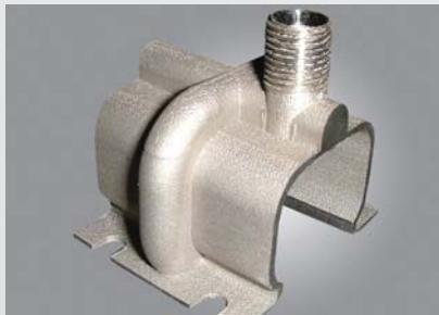
Steam cleaning system manifold.