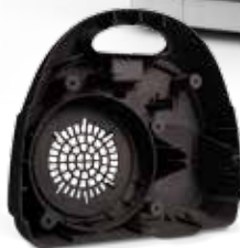
Back cover of vacuum cleaner printed in DuraForm EX Black