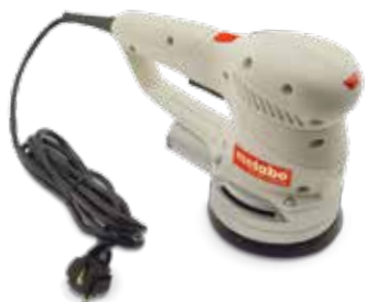
Sander tool housing printed in DuraForm PA material

The sPro SLS systems share a common architecture to produce high-resolution, durable thermoplastic parts available in medium to large build volumes.