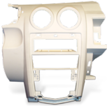
DuraForm PA Dashboard