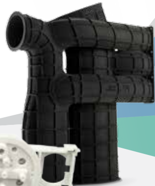
Complex ducting for optimized air flow printed in DuraForm EX Black