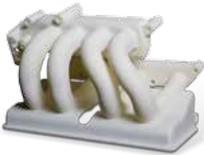
Manifold printed in DuraForm ProX PA

Lower your cost of ownership with automated production tools, remarkably high throughput, material efficiency and repeatability.