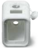
Housing for a laser sensor printed in DuraForm ProX PA