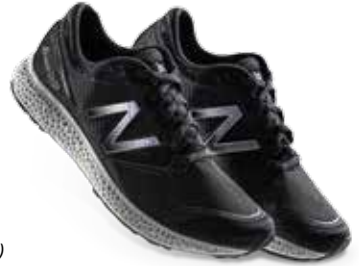
Production running shoe with midsole printed in DuraForm TPU Elastomer

A fiber-reinforced thermoplastic with excellent stiffness, strength and temperature resistance.