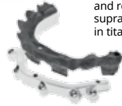
Implant bar and removable suprastructure in titanium alloy