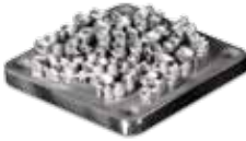
Partials, copings and bridges production in Cobalt Chrome (CoCr)