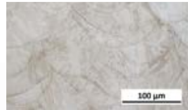
Microstructure as built