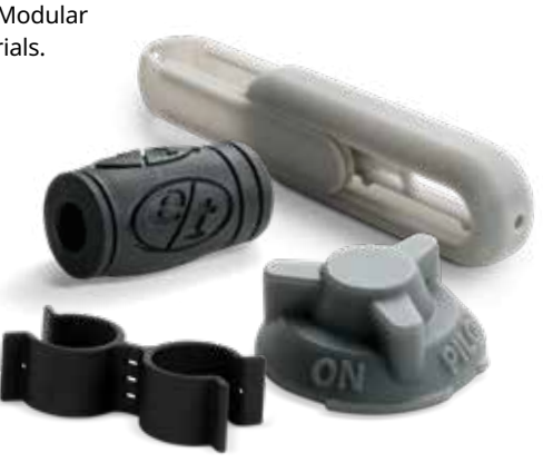
Figure 4 MED-AMB 10*

Rigid ABS-like black material for production applications