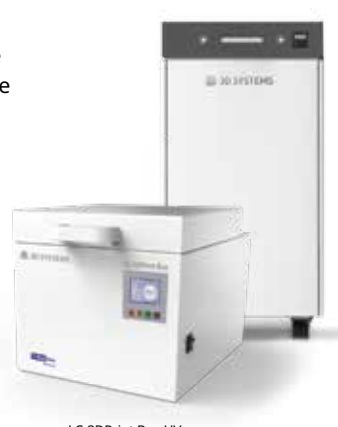
Figure 4 UV Cure Unit 350

The LC-3DPrint Box is available for UV-curing parts and is the recommended UV-curing unit for Figure 4 Modular print materials for parts under 195 mm. The LC-3DPrint Box is a revolutionary UV light box equipped with 12 UV light bulbs strategically placed inside to ensure a product is illuminated from all sides, which results in a quick and uniform curing cycle.