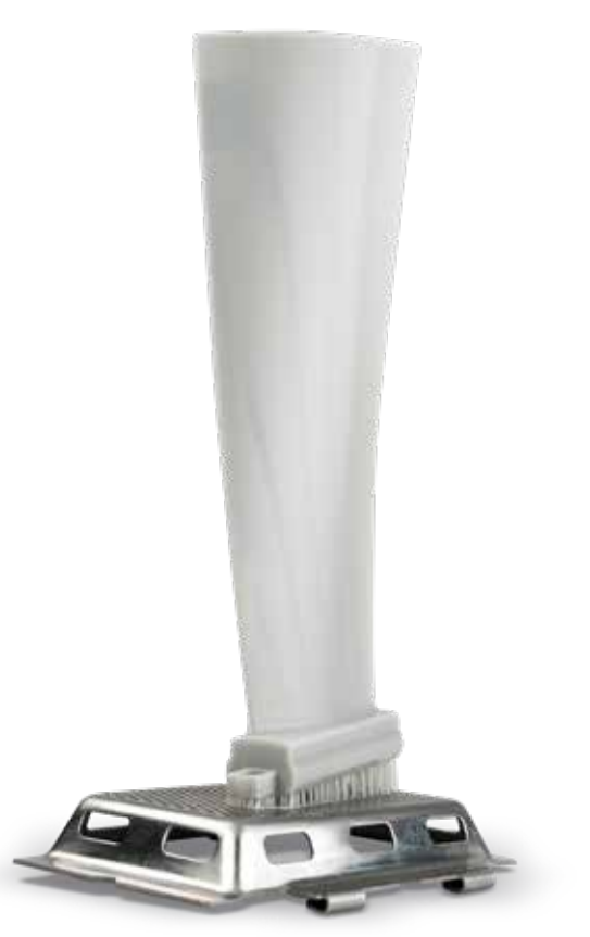
Figure 4 solutions allow manufacturing capacity to grow alongside demand—from a standalone printer for rapid prototyping to modular mid-volume direct production systems that grow as your volume grows, up to a fully-automated, fully-integrated production platform for a complete factory solution.

Produce parts up to 346 mm high with Figure 4 Modular