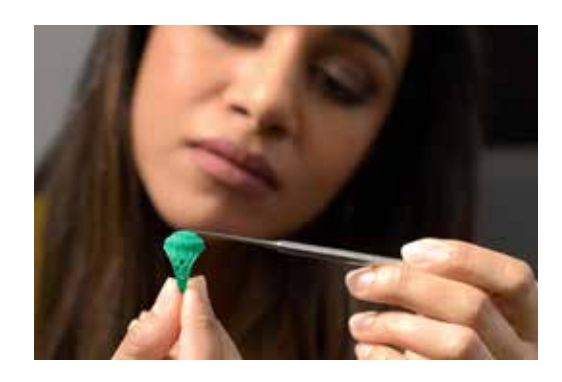
Designed For the Jewelry Casting Professional Producing high-quality investment casting patterns for jewelry applications.

While many processes may work well with Figure 4 JCAST-GRN 10, the procedures outlined in this guide have been tested and shown to be a good starting point* for most users.