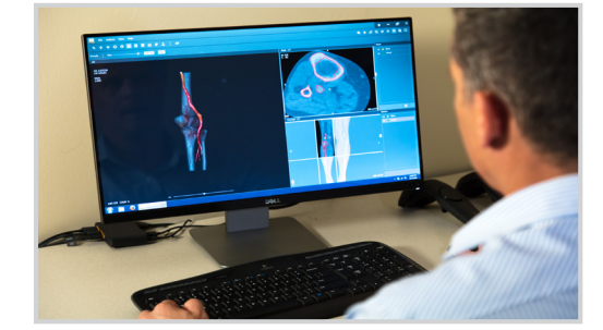
One creation suite to support all model preparation steps

Ready to bring 3D printing technology to Point of Care? 3D Systems is the only company to offer both a software solution and compatible printers of its own indicated for printing diagnostic anatomic models. Anatomic models can be produced using a variety of 3D Systems printing technologies - ColorJet Printing, MultiJet Printing, Stereolithography, and Selective Laser Sintering – including materials that are capable of sterility and biocompatibility.