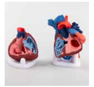
Colorjet Printing (CJP) Full-color anatomic models to aid in visualization of complex structures

Translucent and opaque models printed in our highstrength materials*