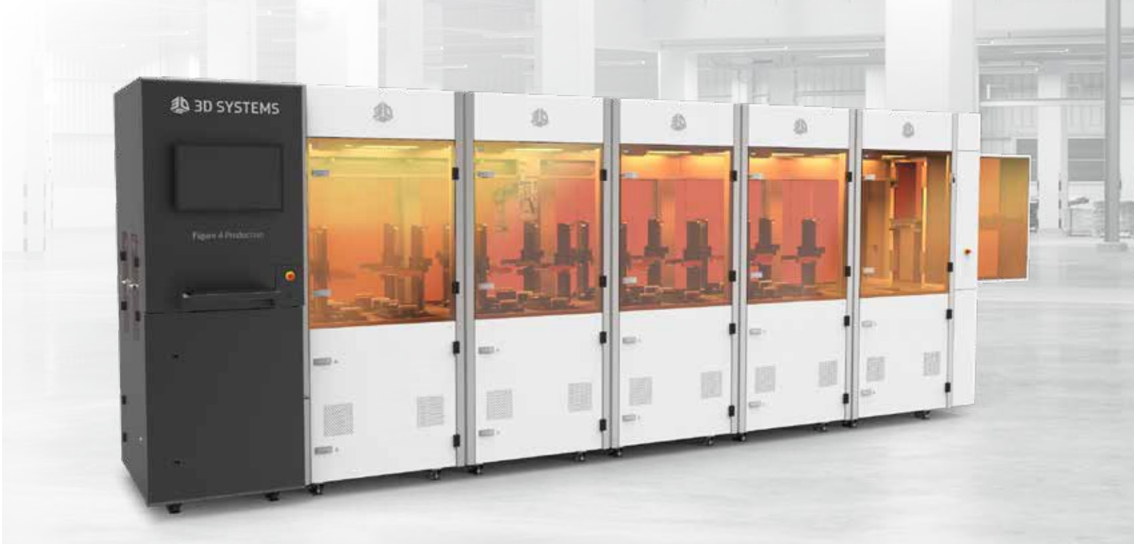
Figure 4 Production combines the design flexibility of additive manufacturing in configurable, in-line production cells to deliver a customizable and automated direct 3D production solution.

Industry's first customizable, fully-integrated factory solution for direct digital production