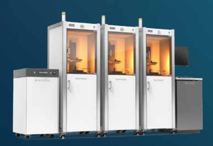
Figure 4 3D printing is ideal for when you require high-speed, high-volume 3D printing of smaller-sized production-grade clear parts. In addition to print speed, Figure 4 maximizes productivity with a short post-cure step that does not require thermal curing. You can also densely pack or nest parts into the build chamber in the most convenient orientation without sacrificing part isotropic properties.