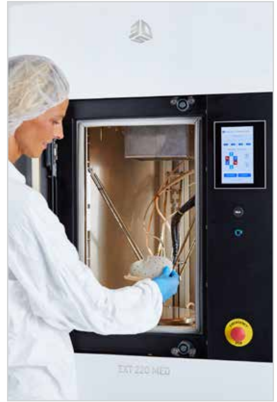
Temperature-controlled chamber with a full build envelope (220mm diameter, 150mm height)