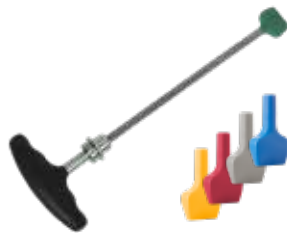
TRIAL SPACERS (RADEL® PPSU)