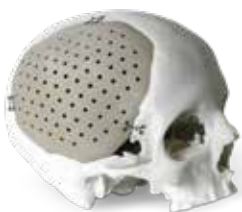
CRANIAL PLATE (PEEK)