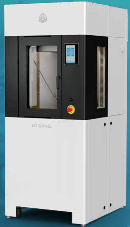
EXT 220 MED 3D Printer