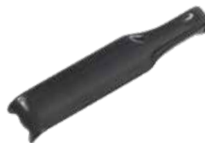
RETRACTOR BLADE (CFR-PEEK)