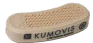
SPINE CAGE (PEEK-BCP)