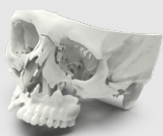
Medical Skull for Surgery Planning