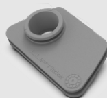
Textured Access Panel