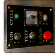
OPERATOR CONTROLS WITH PNEUMATIC TIMER