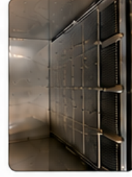
ACCEPTS BUILD PLATFORMS 250MM - 850MM