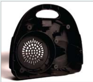
One-part black powder contributes to uniform black color.

It is recommended that DuraForm ® EX plastic be processed in a HiQ™-equipped system, which includes thermal controls. Software version 3.42 or higher (Sinterstation ® HiQ™) or software version 3.545 or higher (Sinterstation ® Pro) is required. SinterScan™ Software is highly recommended, and is required to maximize mechanical properties.